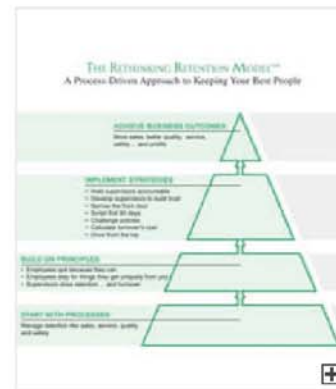
Figure: The Rethinking Retention Model

Vestas, Siemens Wind Bets at Risk on Cheap Gas, Subsidy Loss