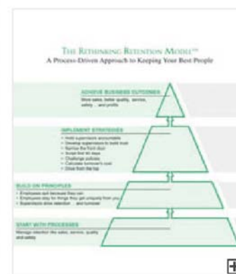
Figure: The Rethinking Retention Model

Vestas, Siemens Wind Bets at Risk on Cheap Gas, Subsidy Loss